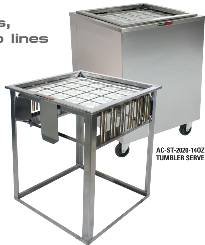
AC-ST-2020-140Z TUMBLER SERVE

All Piper Self-leveling Dispensers feature a self-leveling mechanism that lifts out for easy cleaning. The housing, with its rust-free stainless steel springs, is easily removed for fast, simple, sanitary maintenance.